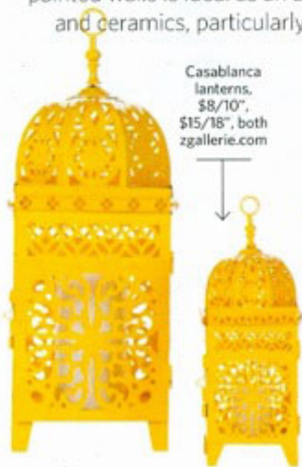
Casablanca lanterns, $8/10", $15/18", both zgallerie.com

Nothing says sunshine better than yellow. "It complements most other colors and works easily as a primary or accent shade," says Casey. It's classic for a living room, but the color also perks up almost any room in the house, from bedrooms and kitchens to playrooms. The zingy taxi cab yellow shade best avoided on painted walls is ideal as an accent on smaller items like throw pillows, curtains and ceramics, particularly in dark rooms with lots of navy, brown or gray.