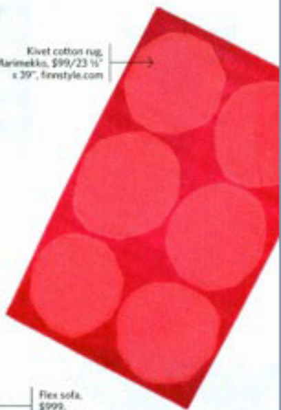
Kivet cotton rug, Marimekko, $99/23 1/2" x 39", finestyle.com