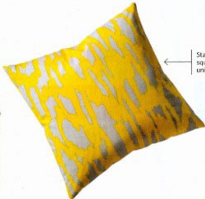
Static lemon square pillow, $36, unisonhome.com