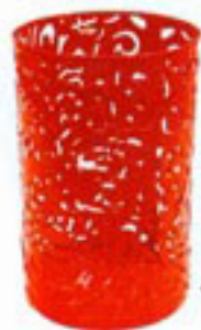
Fan coral embroidered pillow cover, $39, potterybarn.com

The colors of sunshine and surf create an easy-breezy vibe that lasts year-round. BY TERRY TRUCCO