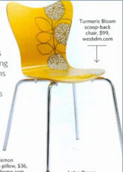
Turmeric Bloom scoop-back chair, $99, westelm.com